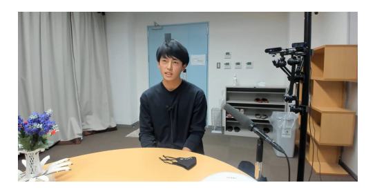
Figure 2: Sample video clip viewed by annotators

ICMI '23 Companion, October 09-13, 2023, Paris, France