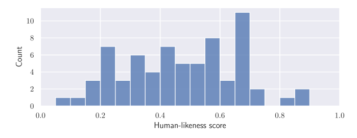
Figure 3: Distribution of human-likeness scores averaged per dialogue

We then considered the possibility of the proposed evaluation method by investigating the relationship between the annotated human-likeness scores and the multimodal user behaviors.